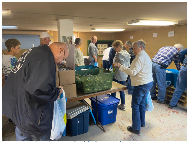
Long-time Lewis Cass Buddy Bags volunteers