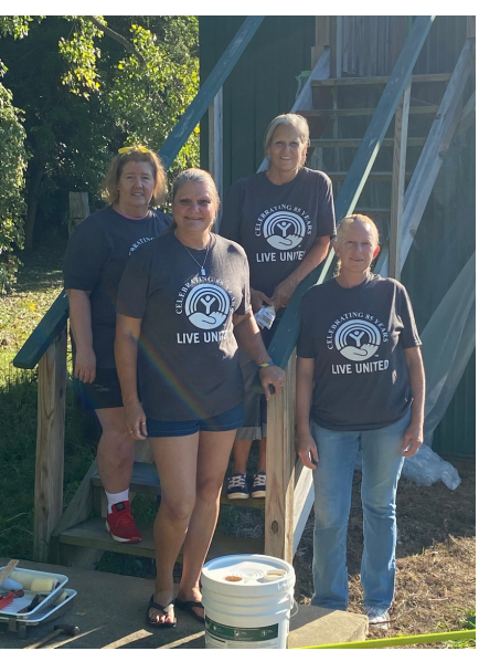
Izaak Walton League & ARaymond volunteers