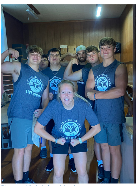
Pioneer High School Seniors